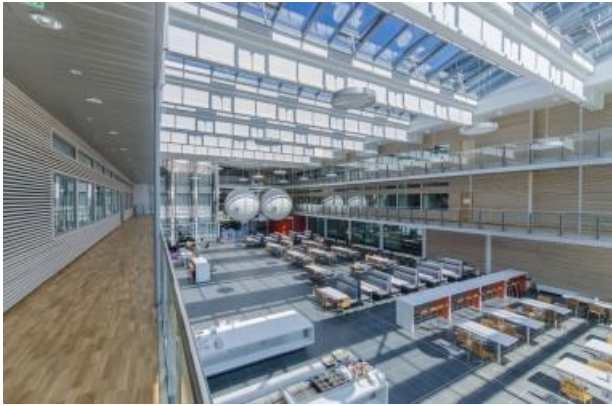
Personell restaurant 3rd floor